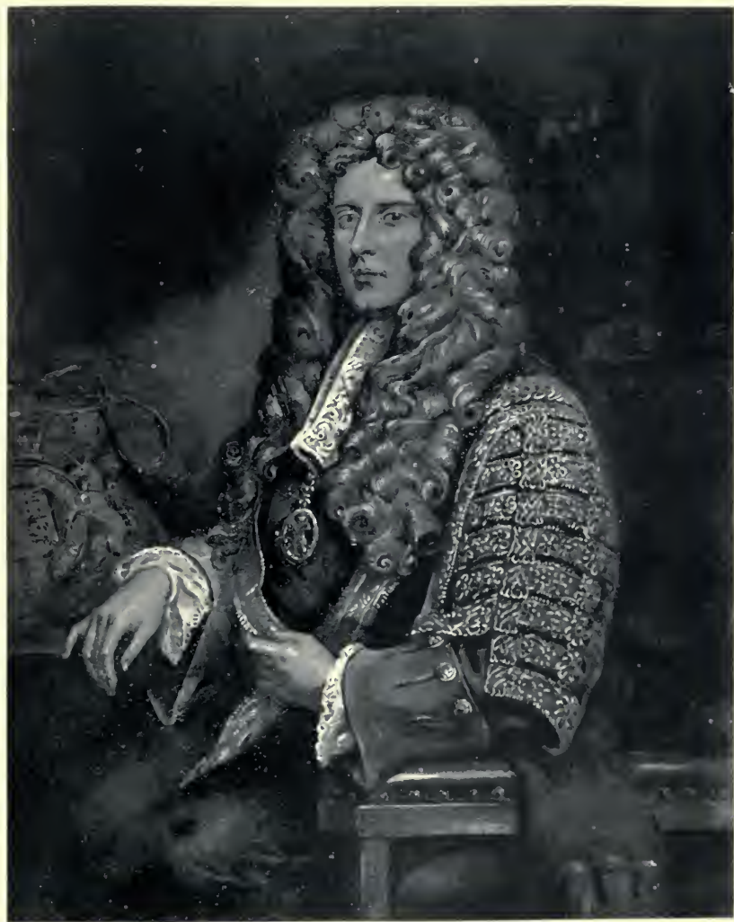
JAMES OGILVY First Earl of Seafield